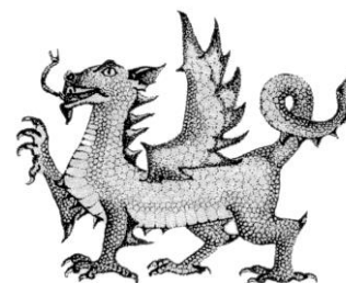
Ballarat & Central Highlands RPG Welsh Pony & Cob Society of Australia Inc.