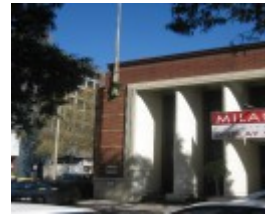
11488 Royal Melbourne Regiment Drill Hall Front Detail 11 Sept 2006 mz