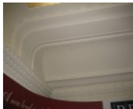
11488 Royal Melbourne Regiment Drill Hall Officers' Mess Cornice and Ceiling Detail 11 Sept 2006 mz