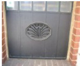
11488 Royal Melbourne Regiment Drill Hall Vent Detail 11 Sept 2006 mz