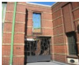
11488 Royal Melbourne Regiment Drill Hall Exterior Detail 02 11 Sept 2006 mz