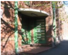
11488 Royal Melbourne Regiment Drill Hall Corner Detail 11 Sept 2006 mz