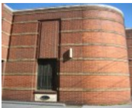
11488 Royal Melbourne Regiment Drill Hall Exterior Detail 01 11 Sept 2006 mz