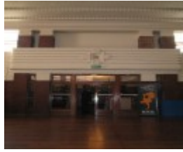
11488 Royal Melbourne Regiment Drill Hall Band Gallery 11 Sept 2006 mz