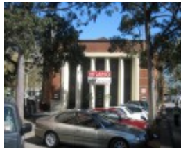
11488 Royal Melbourne Regiment Drill Hall Front Portico 11 Sept 2006 mz