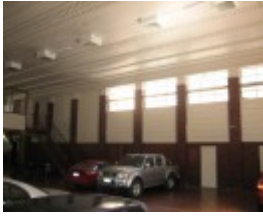
11488 Royal Melbourne Regiment Drill Hall Hall Interior 11 Sept 2006 mz