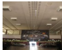
11488 Royal Melbourne Regiment Drill Hall Drill Hall Ceiling 11 Sept 2006 mz