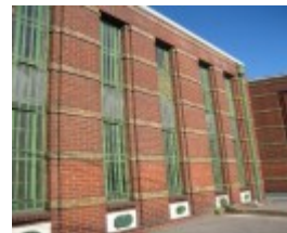
11488 Royal Melbourne Regiment Drill Hall Exterior Window Detail 11 Sept 2006 mz