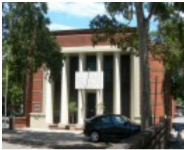
ROYAL MELBOURNE REGIMENT DRILL HALL SOHE 2008