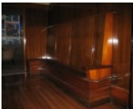
11488 Royal Melbourne Regiment Drill Hall Officers' Mess Bench 11 Sept 2006 mz